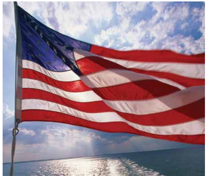
The American flag is an important symbol of the United States.

When the United States became an independent country, the Constitution gave Congress the power to establish a uniform rule of naturalization. Congress made rules about how immigrants could become citizens. Many of these requirements are still valid today, such as the requirements to live in the United States for a specific period of time, to be of good